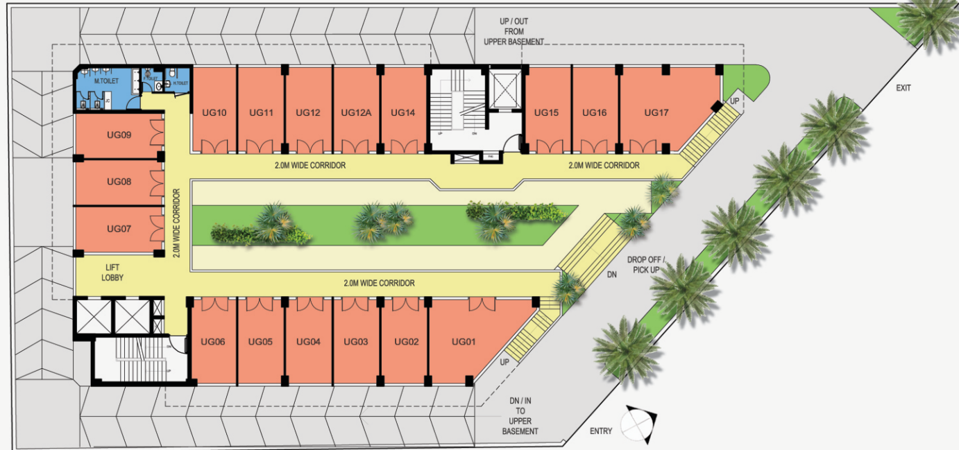
UNIWEST AERO HUB