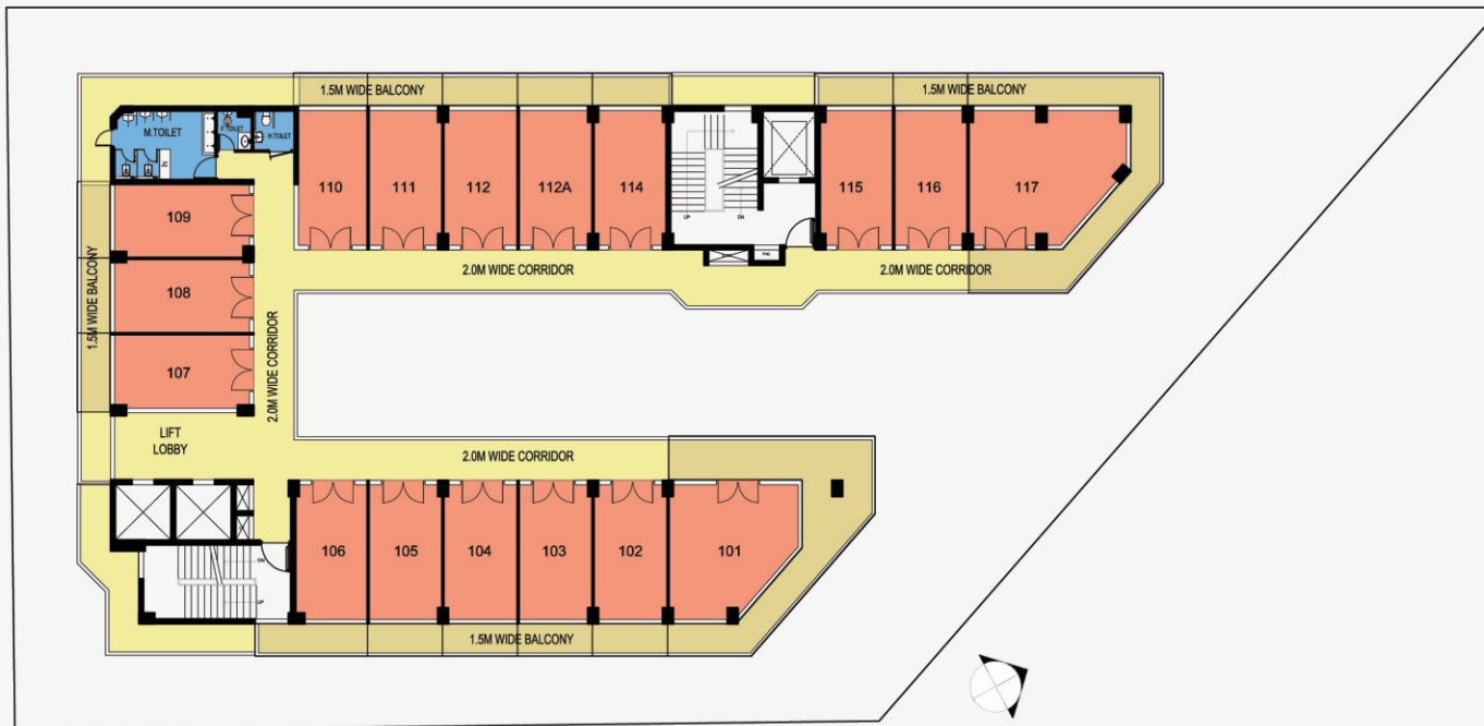
UNIWEST AERO HUB