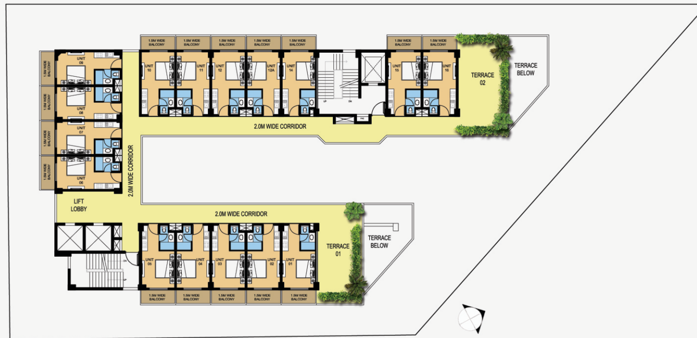
UNIWEST AERO HUB