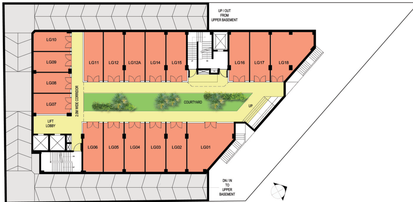
UNIWEST AERO HUB